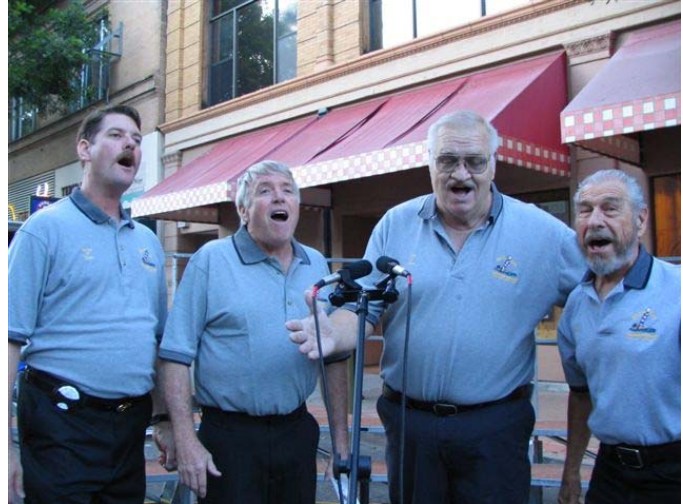
SLO Frequency sings at Farmer's Market August 11, 2005

Non-Profit Organization U.S. Postage Paid San Luis Obispo, CA 93406 PERMIT NO. 194